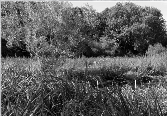
The best example of a chalk river bank in the county.

We have reached our initial target of £165,000 thanks to local fundraising activity and generous community donations. Hertford Town Council have supported us with £30,000. We have recently found out that the Herts and Middlesex Wildlife Trust (HMWT) will cover the shortfall in the funding so that the purchase of land can go ahead. A wonderful Christmas present for the team and people of Hertford!