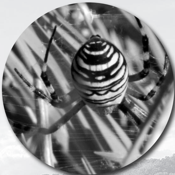
Wasp Spider in the marsh.