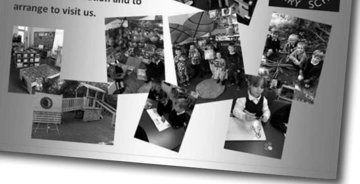
Don't forget Bengeo Day on the 9th July!

Bengeo Primary School has a limited number of places in Reception for September 2023. Please call us on 01992 582765 for more information and to arrange to visit